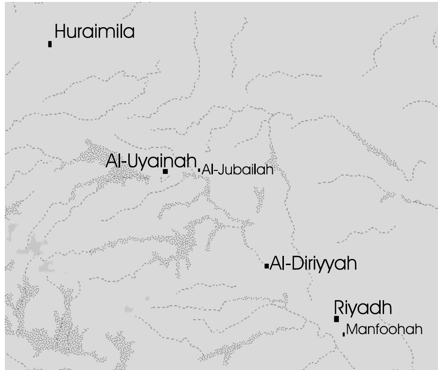
Figure 2. Map of the Relevant Cities of Najd in the Life of Muhammad ibn Abdul-Wahhaab.

Approximate physical distances (not travel routes): Riyadh ( ) to Manfoohah ( ) is about 4.5 kilometers. Riyadh to al-Diriyyah ( ) is approximately 17.8 kilometers. Al-Diriyyah to al-Uyainah ( ) is about 27.5 kilometers. Al-Jubailah ( ) is about 6.5 kilometers due east of al-Uyainah. Huraimila ( ) is about 34.1 kilometers northwest of al-Uyainah.