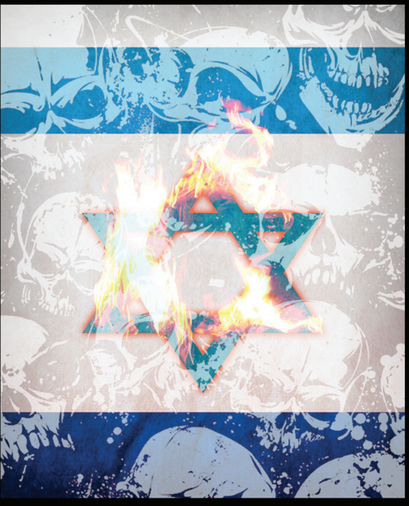
The Salafis and the Palestinian Issue